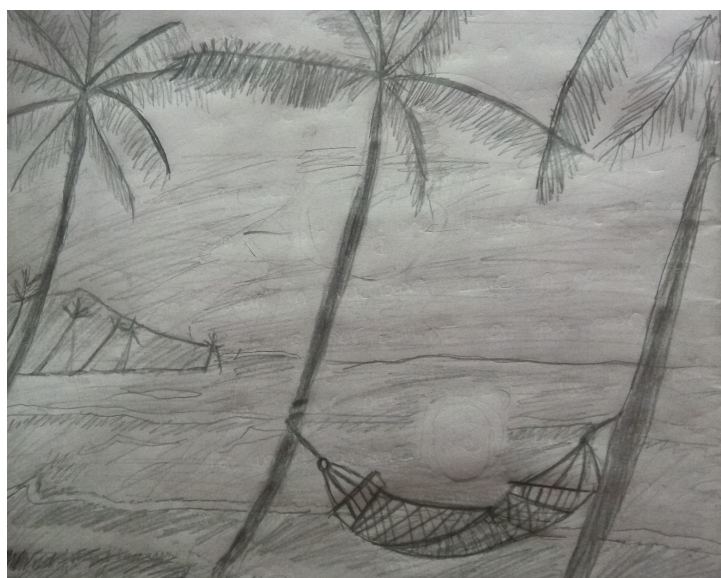
PAVITHA.S - IX STD