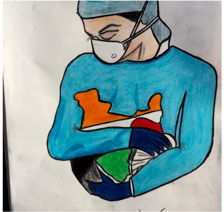
NIRANJAN - IX STD