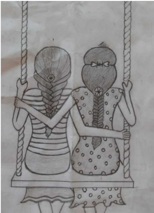
PRIYANKA - IX STD