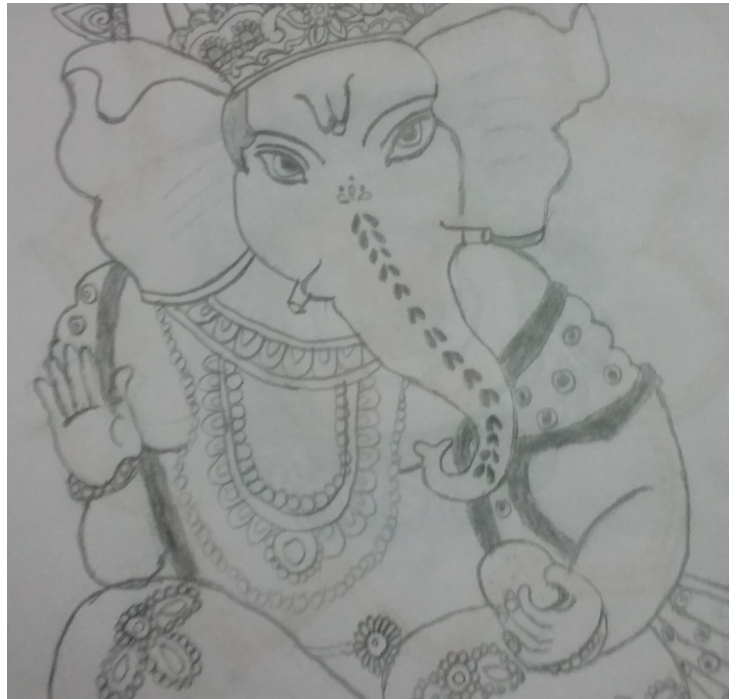
MONISHA - I