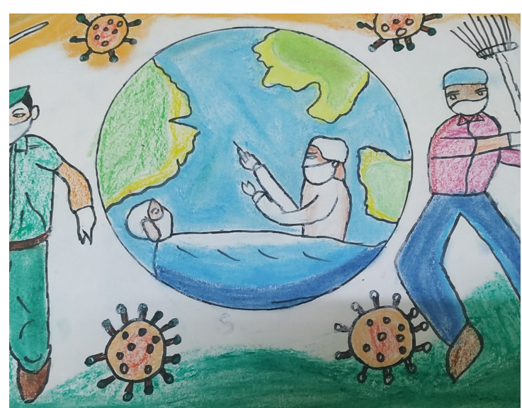
SHAJIRA - IX STD