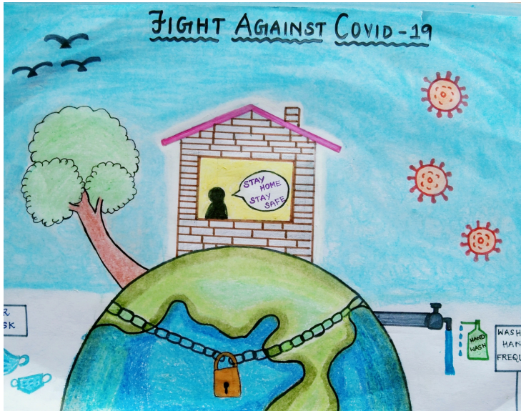
PAVITHRA.C- IX STD