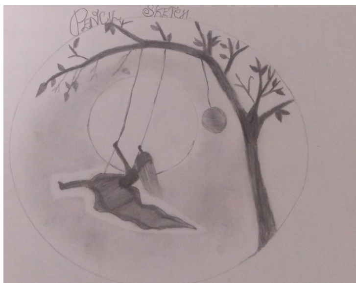
BHAVANA - IX STD