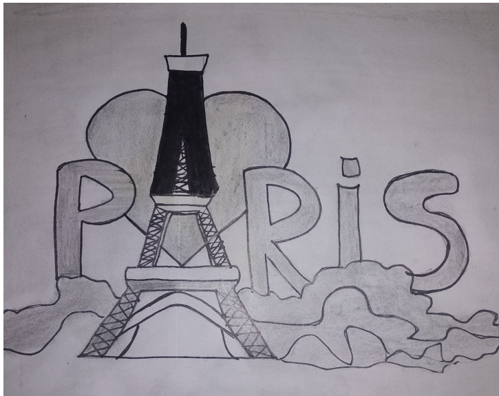
HARIHARAN - IX STD