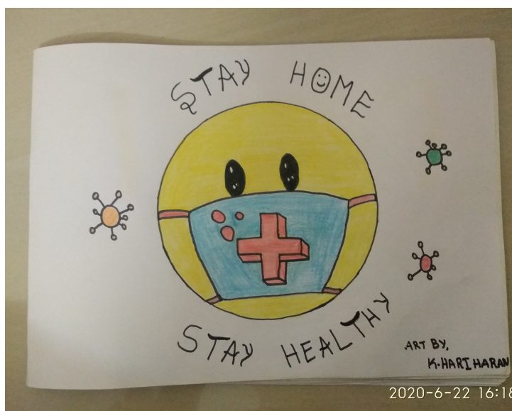
HARIHARAN - IX STD