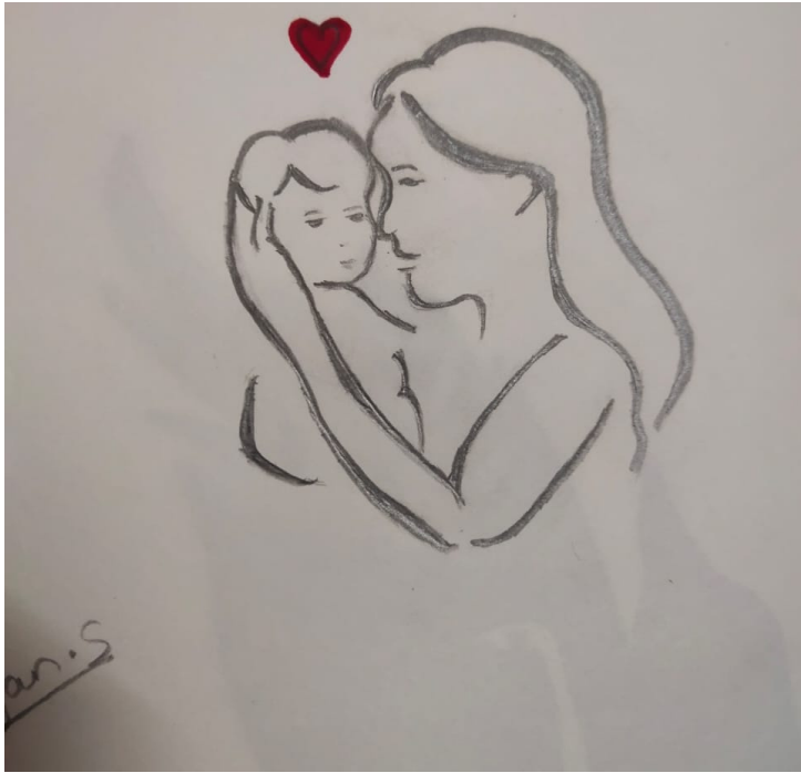
NIRANJAN - IX STD